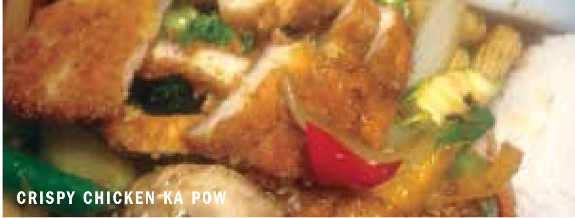
CRISPY CHICKEN KA POW