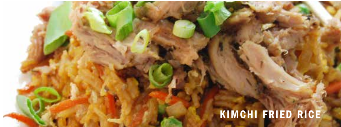
KIMCHI FRIED RICE

Sautéed carrots, green peppers and string beans in a spicy red curry paste sauce.