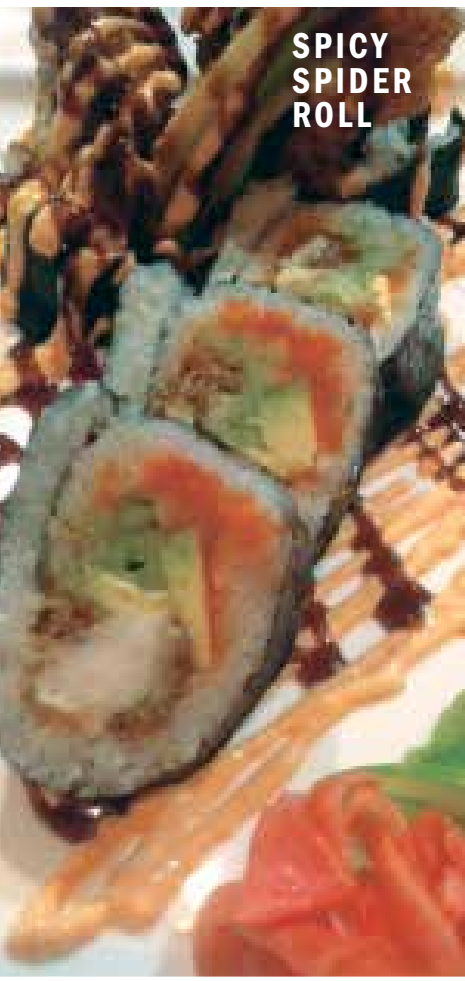
SPICY SPIDER ROLL