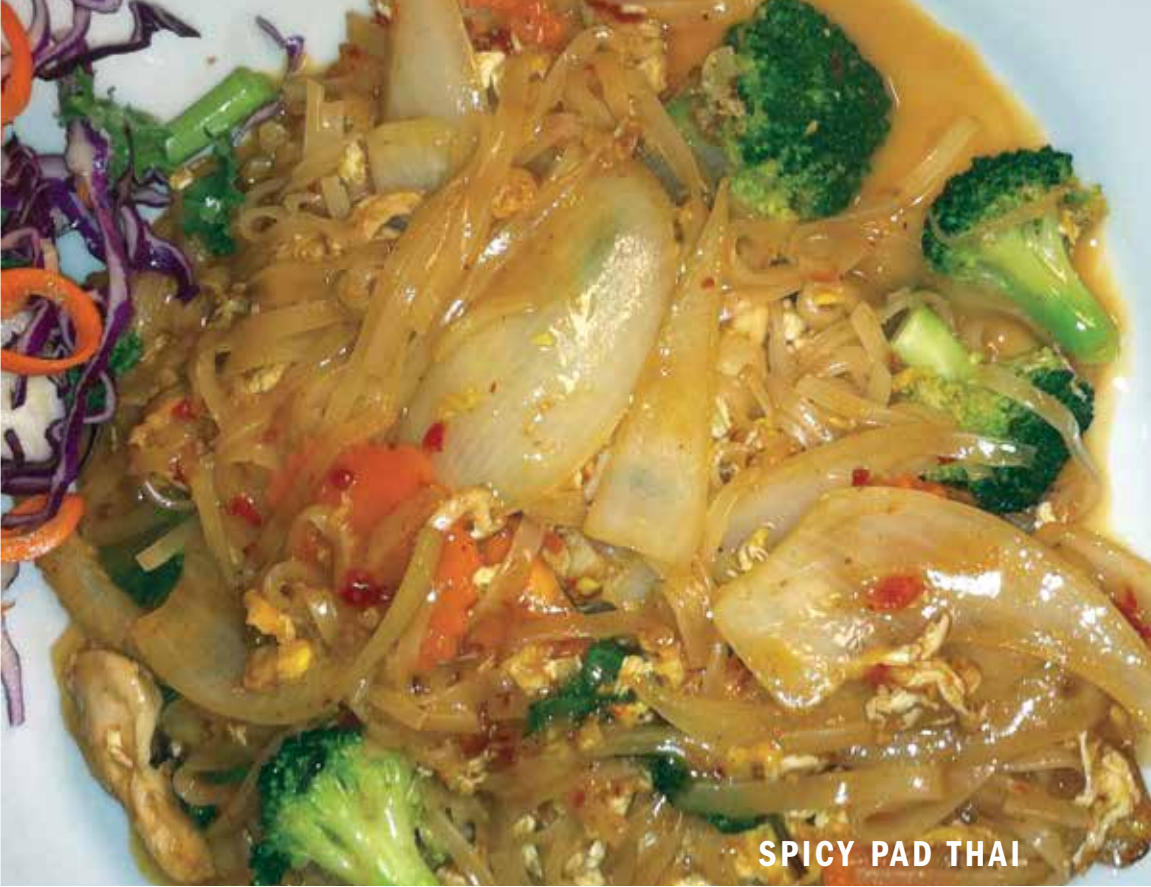
SPICY PAD THAI